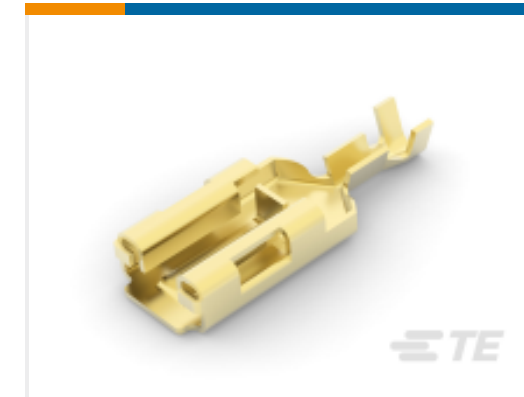
TE Part # 170452-1 PL 250 AM REC 22-20 AWG 0.406 X 21 BR