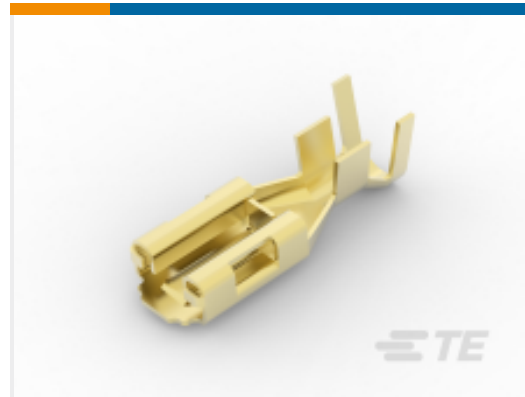
TE Part # 170456-1 PL 250 AUTOMOTIVE REC 12-10 0.40 X 21 BR