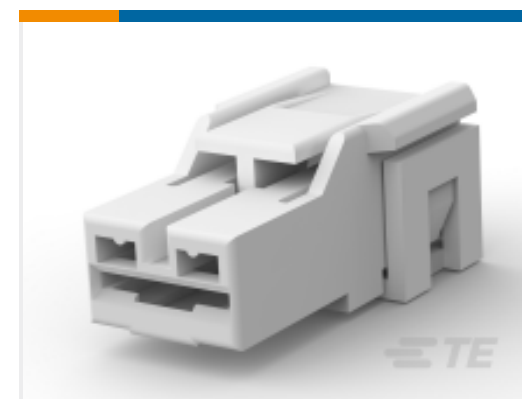
TE Part # 172863-1 250 POSITIVE DBL LOCK 1P