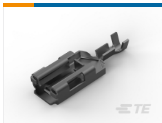
TE Part # 170452-2 PL 250 AUTOMOTIVE REC 22-20 AWG PRE TPBR