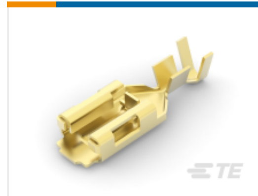
TE Part # 170454-1 PL 250 AUTOMOTIVE REC 18-14 0.40 X 21 BR