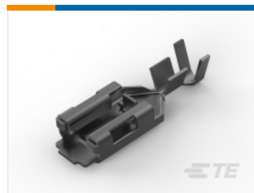
TE Part # 170454-2 PL 250 AM REC 18-14 0.40 X 21 PRE-TPBR