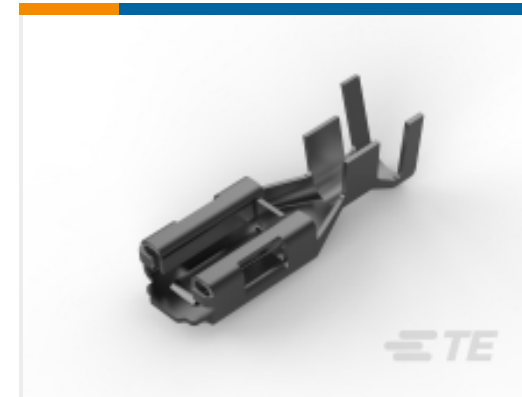
TE Part # 170456-2 PL 250 AM REC 12-10 0.40 X 21 PRE-TPBR